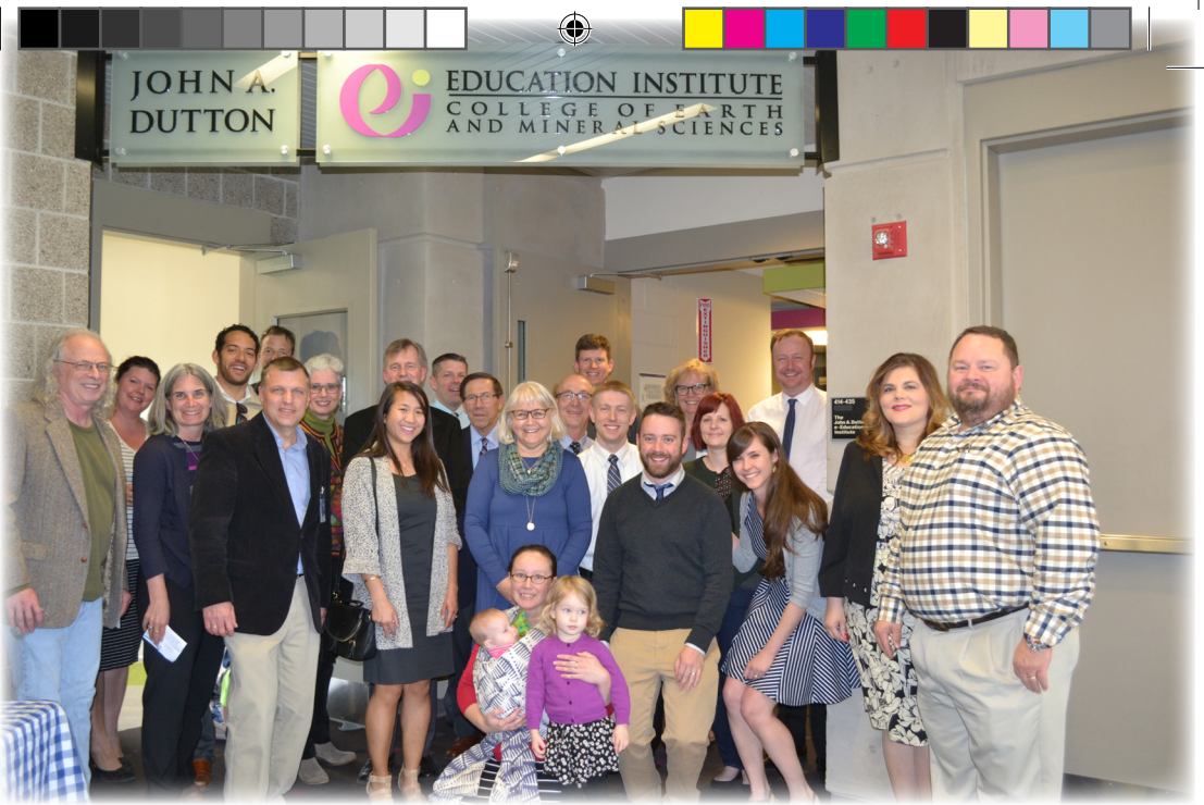
Online Geospatial program graduates with their families and faculty attending a pre-Commencement reception at the John A. Dutton e-Education Institute on May 7, 2017.